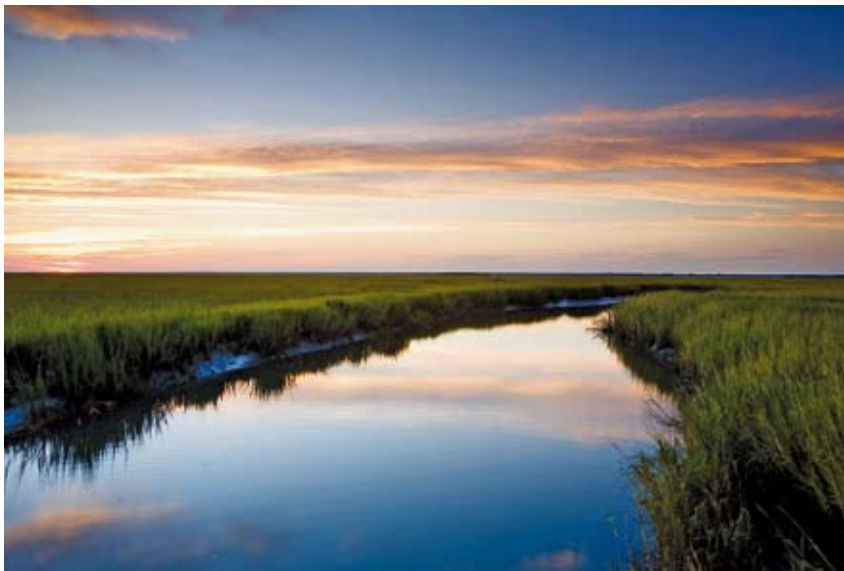
A sunset paints a rainbow over a marshy creek at Hunting Island State Park.

A lush new book celebrates South Carolina's state parks—and makes you want to mellow out at one. BY PATRICIA WILENS